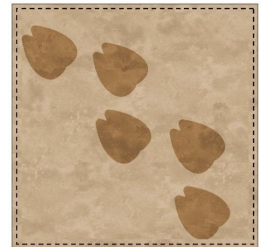
Trim to 12½" square