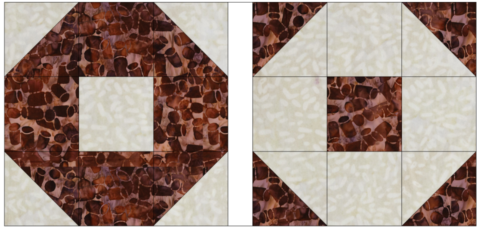
Blocks shown in FIGO Midsommar (above), Banyan Vino (right) and Northcott Shimmer (below)